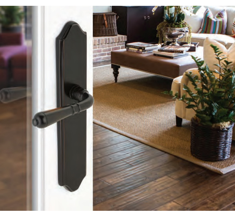
Concord 2" x 10" Plate, Non-Keyed, Turino Lever, Oil Rubbed Bronze (US10B)